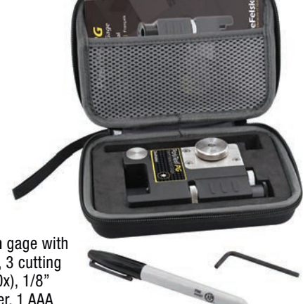
PosiTest PG Kit