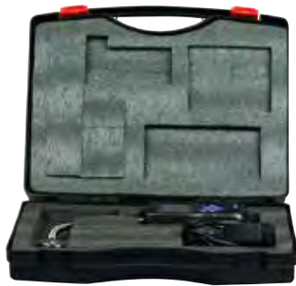
FG-3000R with Accessories in Included Carrying Case