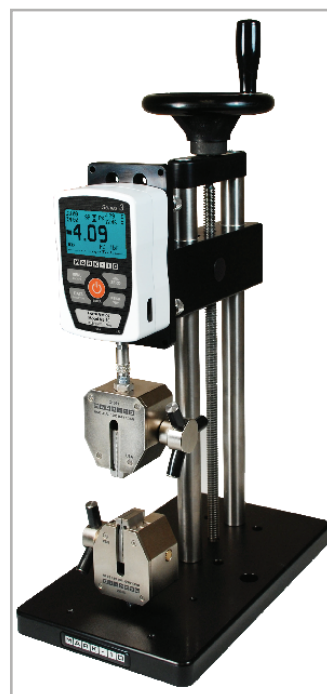
Shown with an ES20 test stand and G1061 wedge grips

The gauges include MESUR Lite data acquisition software. MESUR Lite tabulates continuous or single point data. One-click export to Excel allows for further data manipulation.