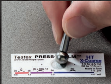
For use with Testex™ Press-O-Film™ Replica Tape

Measures and records surface profile parameters using replica tape